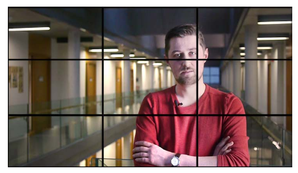
Medium Wide Shot: Make sure to frame your shot so the subject is talking towards the side with the most space.

Set up your main camera with the lens at eye level with the subject. If your camera is too high, the subject will appear smaller than they are; too low and the subject will appear bigger. Have the subject look just past the lens. A perfectly centred shot can look odd, so try to offset your subject to one side.